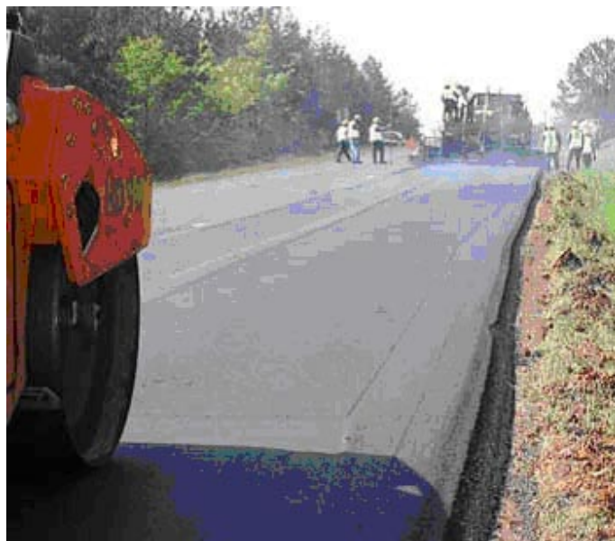
Resurfacing a roadway with a “Safety Edge”

The Georgia Department of Transportation (GDOT), working with the FHWA, has demonstrated the ability to construct the “Safety Edge” with no impact on production and at less than 1% additional material costs. Based on the successful performance after one year in