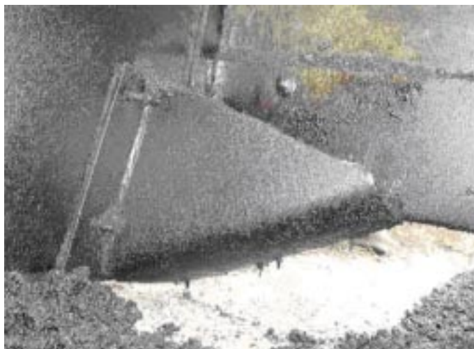
A special edging device on resurfacing equipment creates the “Safety Edge”

The angled asphalt edge, or fillet, provides a safer roadway edge, and a stronger interface between the roadway and the shoulder. The cost of providing an asphalt fillet is minimal in comparison to the total amount of the resurfacing contract, and pays back in countless dollars saved from reduction of fatalities, injuries, property damage and lawsuits. The fillet ties the existing shoulder into the resurfaced roadway and allows a vehicle to reenter the roadway safely. Highway agencies are able to restore the shoulder after the resurfacing project is completed.