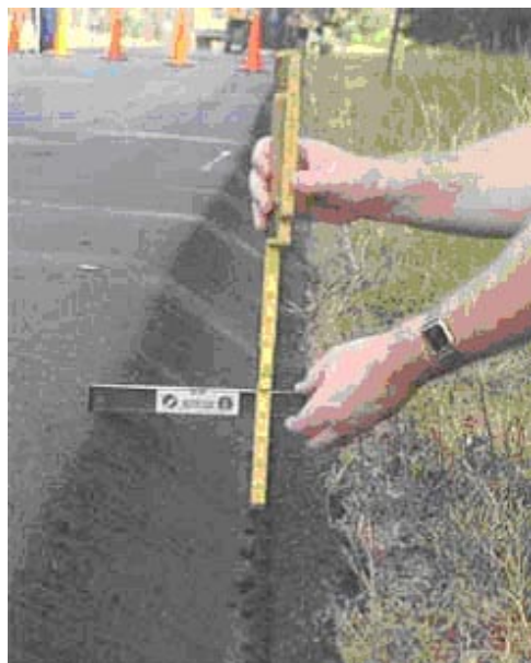
An inexpensive way to assure safe pavement edges is to specify a 30 degree to 35 degree angle asphalt fillet “Safety Edge” on all road construction and resurfacing