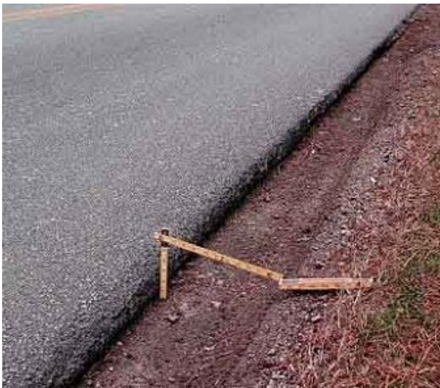
An unsafe pavement edge

“The Safety Edge” can save lives, reduce tort liability, reduce maintenance expenses, and costs less than 1% of a typical pavement resurfacing budget.